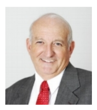
Dear Fellow Shareholders,

I begin by noting that whilst the report before you covers the six month period to 31 December 2019, it is in the format of an Annual Report, following the decision by the Board to change the financial year end of the Company from 30 June to 31 December. This decision was taken to align the reporting schedule of the Company with its operating entities in Indonesia.