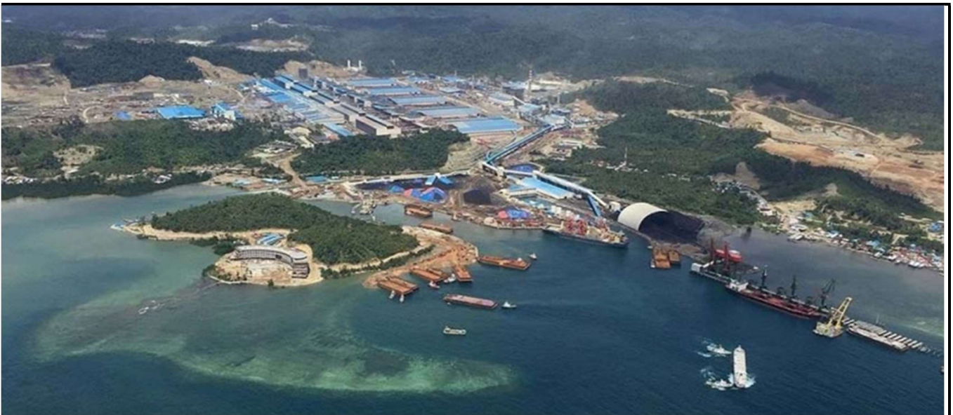
Aerial photo of the IMIP.

Nickel Mines also holds an 80% interest in the long life, high grade Hengjaya nickel mine located in Morowali Regency, Central Sulawesi, Indonesia just 12 kilometres from the IMIP. The Hengjaya mine hosts a JORC 2012 compliant Resource of ~37.5 million dry metric tonnes at 1.81% nickel (0.7Mt Measured, 15.0Mt Indicated, 22.0Mt Inferred using a 1.5% nickel cut-off) ~680,000 tonnes of contained nickel metal.