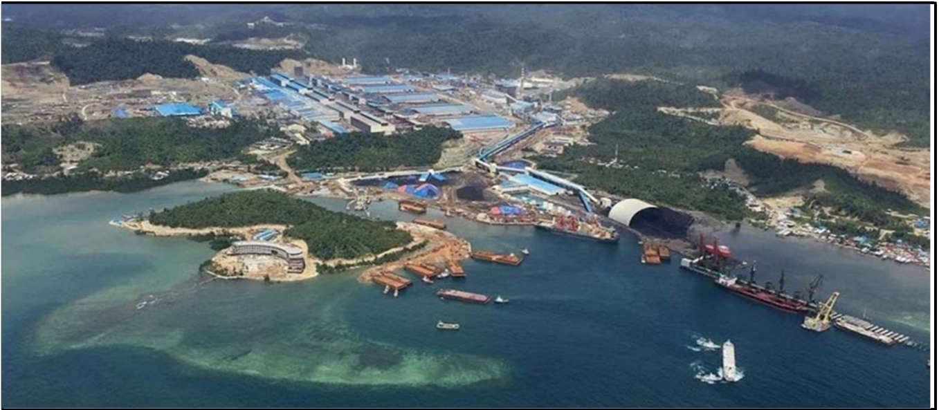
Aerial photo of the IMIP.

Nickel Mines also holds an 80% interest in the long life, high grade Hengjaya nickel mine located in Morowali Regency, Central Sulawesi, Indonesia just 12 kilometres from the IMIP.